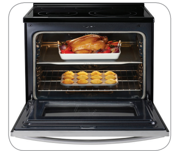
Flex Duo™ Oven