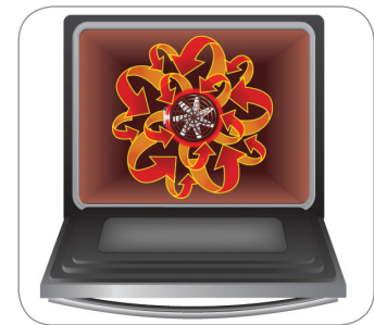
Dual Convection Oven