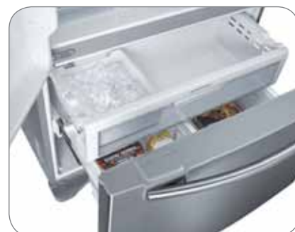
Automatic Filtered Ice Maker in the Freezer