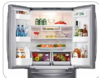
French Door Design