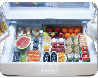
FlexZone™ Drawer with Temperature Control and Smart Divider