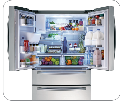
French Door Design