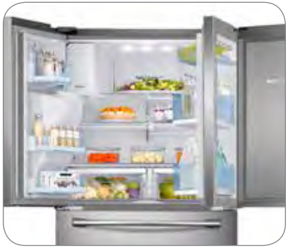
Food ShowCase Fridge Door