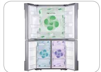
Triple Cooling System