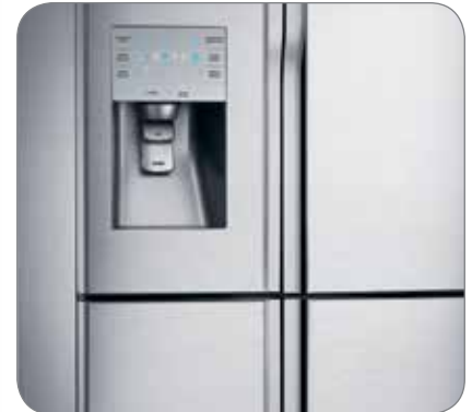
Clean, Modern Design