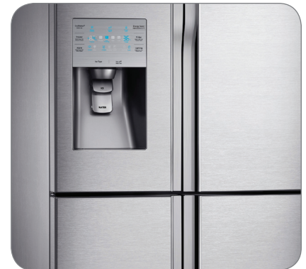
Clean, Modern Design