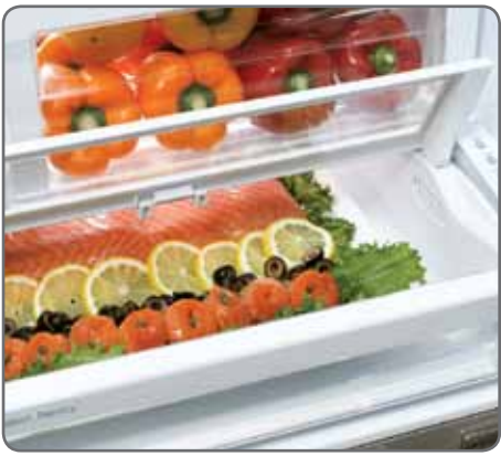
Cool Select Pantry™ with Temperature Control.