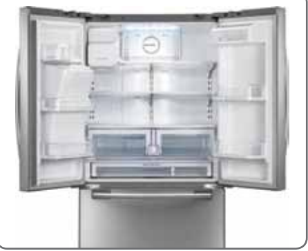
French Door design provides easy access to fresh food and flexible storage options.

Provides additional temperature control for your food storage needs with Quick Cool, Thaw and Soft Freeze, Chill Mode, and Cool Mode options.