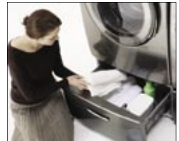
Optional Convenient 15" Pedestal

Design and specifications are subject to change without notice. Non-metric weights and measurements are approximate.