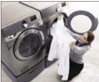
Sensor Drying Technology