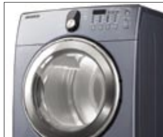
DOT LED Center Jog Dial