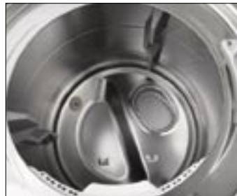
Large 7.3 cu. ft. Capacity and Stainless Steel Drum