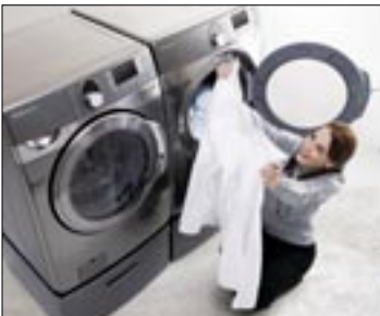
Steam Drying Technology