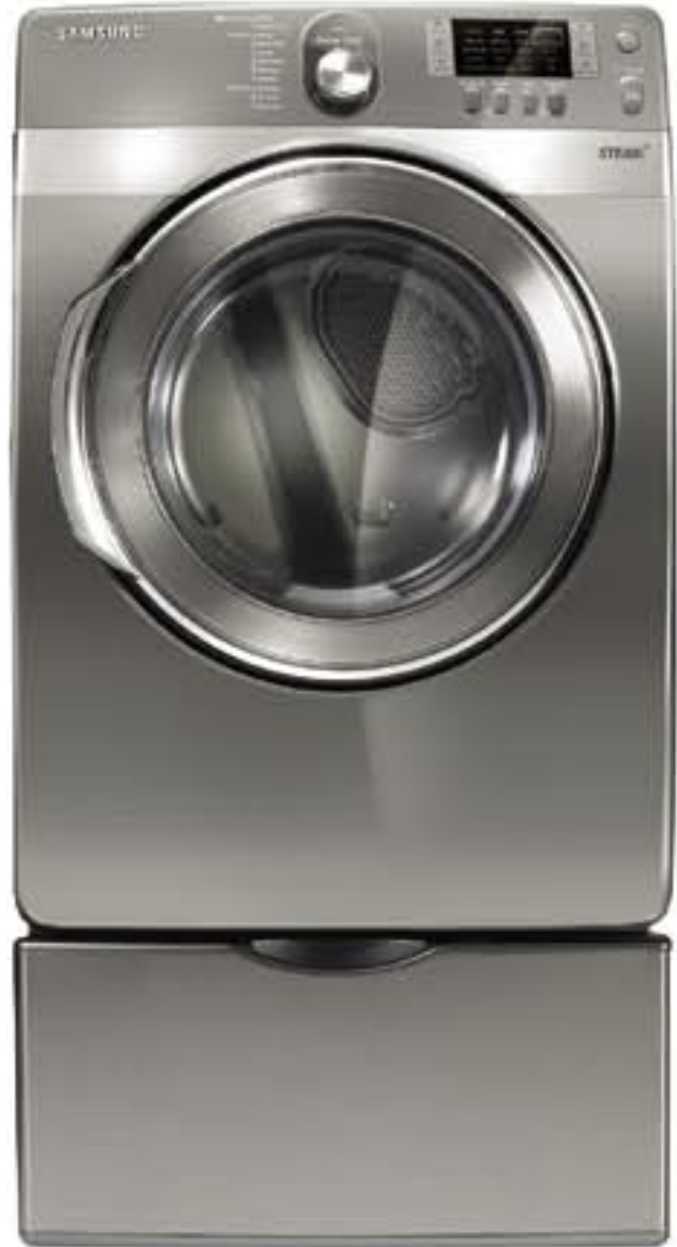
(Shown with optional pedestal)