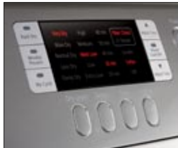
2.5" Large LCD Display with Electronic Controls