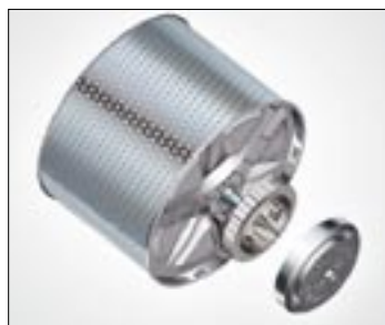
Direct Drive Inverter Motor