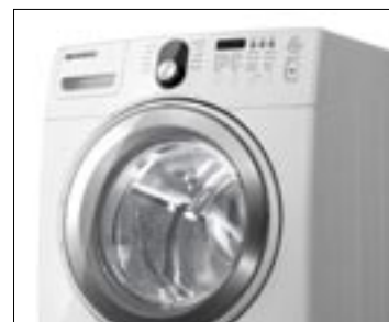
WF218ANW – Side View