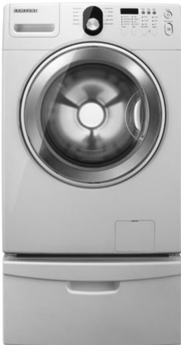
(Shown with optional pedestal)

Samsung's Vibration Reduction Technology (VRT™) allows installation on second floors or near bedrooms because it provides smooth operation at spin speeds up to 1100 revolutions per minute, significantly reducing vibration and noise while improving handling of unbalanced loads.