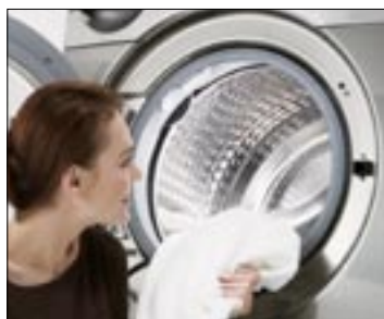
Large 4.0 cu.ft. Capacity