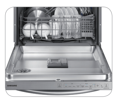
Stainless Steel Interior Door