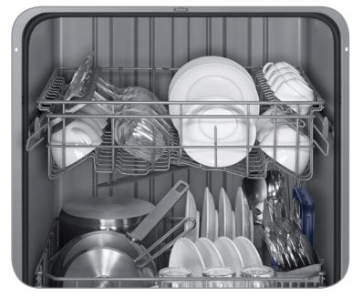
Height-Adjustable Upper Rack