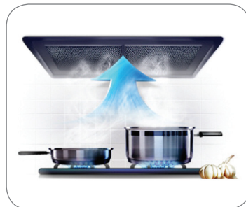
2-Speed/300 CFM Ventilation System