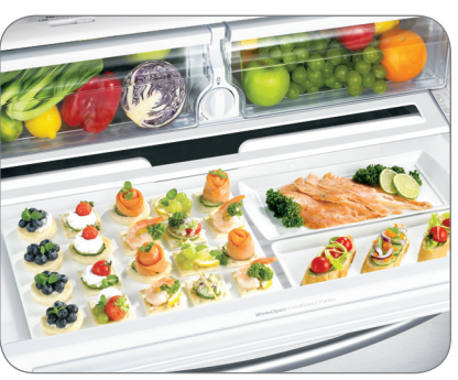
CoolSelect Pantry<sup>™</sup> with Temperature Control