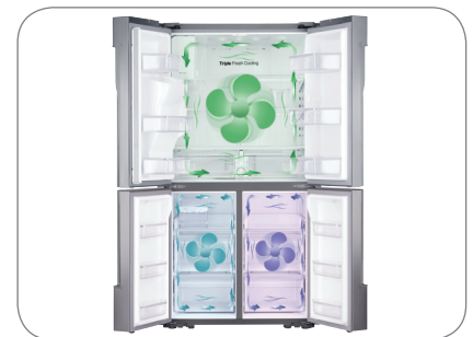
Triple Cooling System