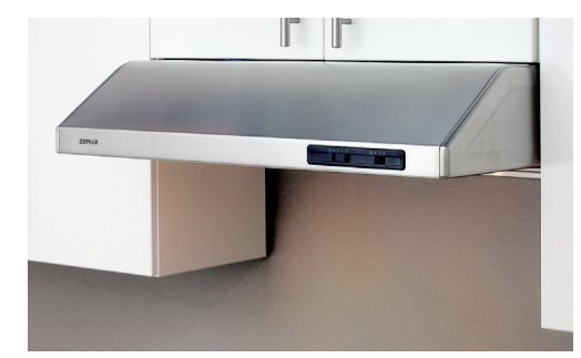
CYCLONE Modern, clean lines provide a perfect complement to any interior, while centrifugal blowers liquefy cooking residue without complex filters to make cleaning a snap.