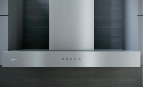
ROMA WALL A bold, angular presence at a surprisingly affordable cost. Ideal for the designsavvy chef or builder on a budget. SIZE: 30", 36" | CFM: 290, 600