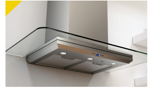
VERONA WALL An LED strip surrounds this unique straight-glass canopy range hood and rotates simplicity, Modena comes pre-loaded with DCBL between blue, white and amber while on Demo mode. SIZE: 30", 36" | CFM: 715

NEXT GENERATION EUROPA Featuring the sophistication of European design and Zephyr's DCBL Suppression System™ - the new benchmark in range hood performance.