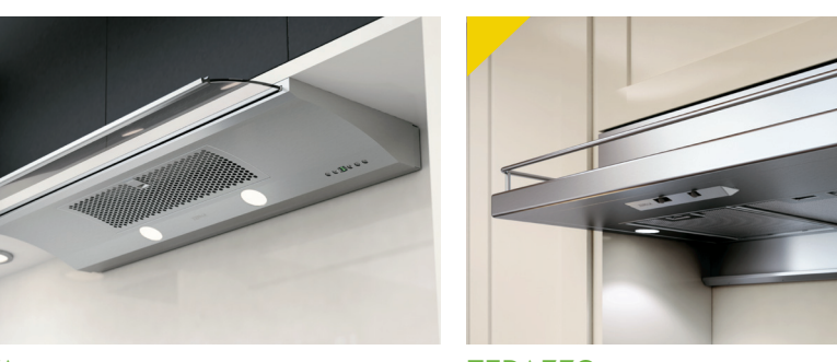
GENOVA Genova's crescent-like body delivers TERAZZO Bearing the gift of style, Terazzo's true stunning design and quality performance. Its re-12-inch cabinet depth and the ingenious terraced tractable visor controls the hood's motor and lights. display rack make it a perfect addition to any kitchen. Available with optional remote control. SIZE: 30", 36" | CFM: 290, 400 SIZE: 30". 36" | CFM: 290. 500

EUROPA CLASSICS UNDER-CABINETS Never under-featured, our collection of under-cabinet range hoods provide the looks and performance of their chimney-gifted counterparts.