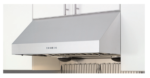
TEMPEST I Expect a lifetime of power and perforand enhance the hood's professional aesthetic. SIZE: 30", 36", 42" | CFM: 600, 1100

PRO-STYLE & POWER PACKS When powerful ventilation is what you need, look no further than Zephyr's pro-style and power pack options. Built for professional-grade performance these hoods are also feature-rich and offer multiple installation options.