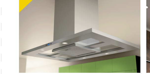
MODENA ISLAND Equipped with DCBL Suppression™ technology, Modena island performs whis-flight of hand-formed glass, with touch-sensitive per-quiet air removal while flaunting its advanced BloomTM LED light bulbs on its one-inch canopy. SIZE: 36", 42" | CFM: 715