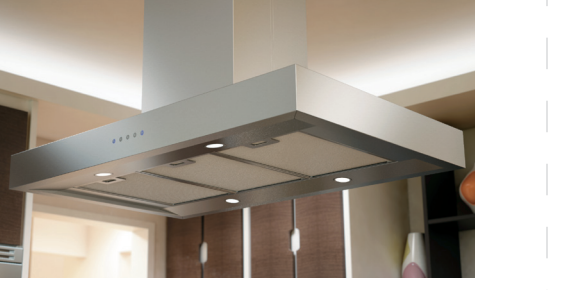
ROMA ISLAND A surprisingly beautiful and affordable island design. Roma is ideal for the designsavvy chef, or builder that won't settle for mediocrity. SIZE: 36", 42" | CFM: 600

EUROPA CLASSICS UNDER-CABINETS Never under-featured, our collection of under-cabinet range hoods provide the looks and performance of their chimney-gifted counterparts.