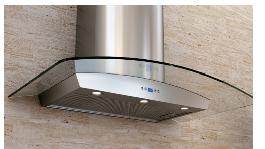
MILANO (G) WALL Curved-glass canopy design, LCD controls, dimmable LED bulbs and DCBL technology deliver high style without compromise.