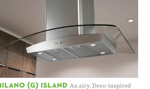
MILANO (G) ISLAND An airy, Deco-inspired controls, adjustable lighting and powerful blowers. SIZE: 36", 42" | CFM: 715