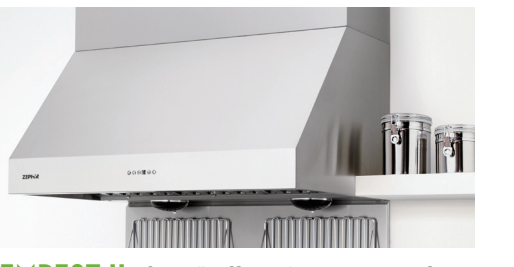
TEMPEST II The 18" tall version our pro-style mance, plus sleek electronic controls that streamline range hoods, Tempest II is designed with professional -grade performance and seamless contours. SIZE: 30", 36", 48" | CFM: 290, 600, 1100