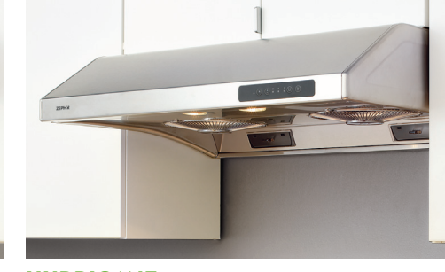
charge of the self-cleaning three-speed 695-CFM