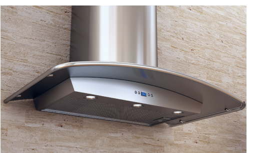
MILANO (S) WALL Upgraded with Zephyr's DCBL Suppression System™, Milano takes range hood performance to higher grounds with Bloom LED light bulbs and LCD controls.