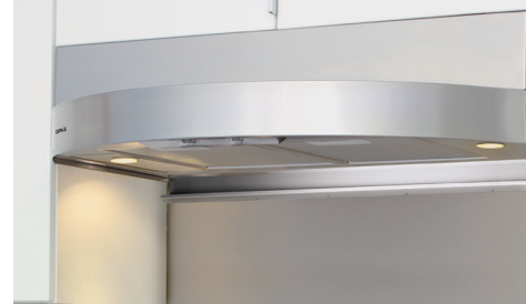
TAMBURO An elegant curve encircles twin halogens and the three-speed motor. An adjustable utensil bar puts your cooking tools where you need them.

kitchens or for island settings where ceilings are too high for ducting, Sorrento rises to the occasion as a downdraft hood option.