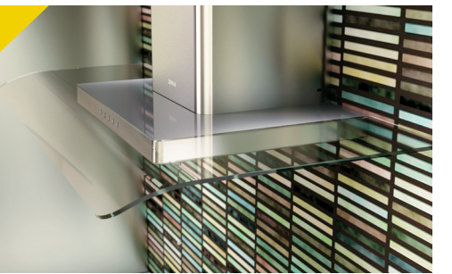
ANGOLO WALL An elegant and playful range hood, Angolo comes equipped with Electronic LED controls and a 600-CFM motor. SIZE: 30", 36" | CFM: 290, 600

EUROPA CLASSICS Classic never goes out of style. The Europa Classics offer industry leading performance and features that also provide the best value.