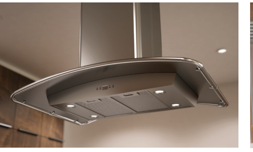
MILANO (S) ISLAND A bold technological breakthrough, DCBL Suppression System™ transforms the Milano island into the quietest, most effecunique Quick-Lock installation system, Napoli is a tive and energy efficient range hood available today. cut above the rest. SIZE: 36". 42" | CFM: 715