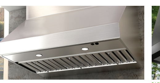
CYPRESS The seamlessly contoured, corrosionresistant 316-grade stainless steel canopy houses high-performance stainless steel baffle filters. SIZE: 36", 42", 48" | CFM: 600, 1000, 1100