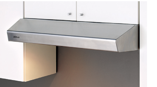
BREEZE II Superior performance in a quiet, SIZE: 30", 36" | CFM: 400