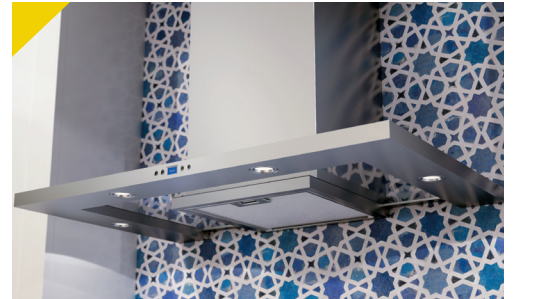
MODENA WALL A study in clean modern Suppression<sup>™</sup> technology so its performance will be as stunning as its looks. SIZE: 30", 36" | CFM: 715