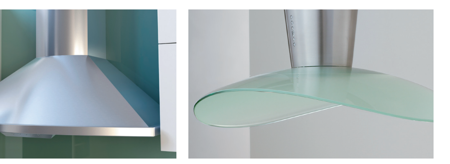
TORINO ISLAND The sculpted glass canopy SAVONA WALL Our most affordable full-featured hood comes in stainless steel or black with is yours in green, blue, red or yellow. An infrared remote adjusts power and light from a distance. three speed levels and two halogen lamps. SIZE: 30", 36" | CFM: 290, 685