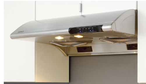
TYPHOON A smooth, sophisticated wing in black, white, bisque or stainless steel houses a powerful yet virtually noise-free 850-CFM blower. SIZE: 30", 36", 42", 48" | CFM: 850

POWER & BREEZE SERIES Robust power and superior value make the Power and Breeze Series best-in-class range hoods. With advanced components and backed by our industry leading warranty, Power and Breeze range hoods always live up to their name.