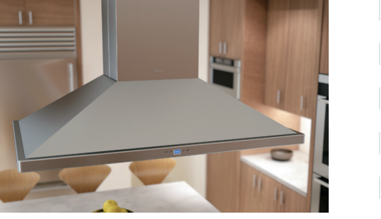
NAPOLI ISLAND Upgraded with Zephyr's DCBL Suppression System™. Bloom HD LED bulbs and the