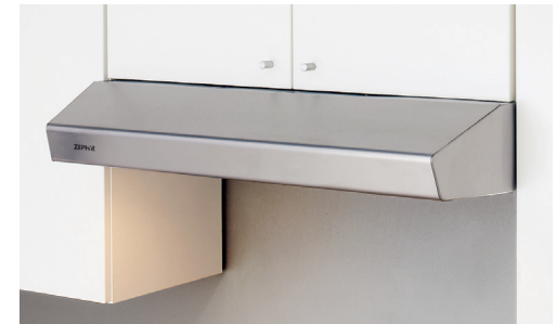
BREEZE | Breeze I is an exceptional value. Its 250-CFM blower quietly remove odors, and the standard dual-level halogen bulbs brightly illuminate the cooktop below.