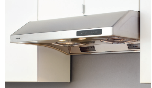
HURRICANE Electronic touch-controls take blowers and dual-level halogen all work together to make your life just a little bit easier. SIZE: 30", 36" | CFM: 695