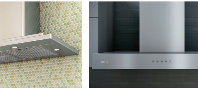
FIRENZE WALL A Europa Classic, Firenze's hybrid features provide the focused performance of a 600-CFM motor with the upgraded lighting of Bloom HD LED light bulbs.