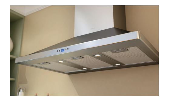
VENEZIA WALL A timeless design, Venezia's formidable design now houses Zephyr's DCBL Suppression System<sup>™</sup> and elevates this ageless range hood to unparalleled levels of performance.