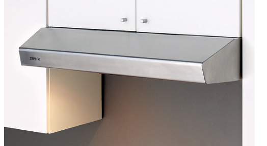
low-profile package, Breeze II comes equipped with a quiet, three-speed 400-CFM blower and standard 2-level halogen bulbs.