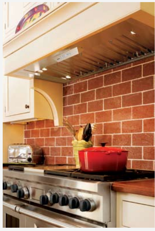
Shown here with optional baffle filters.