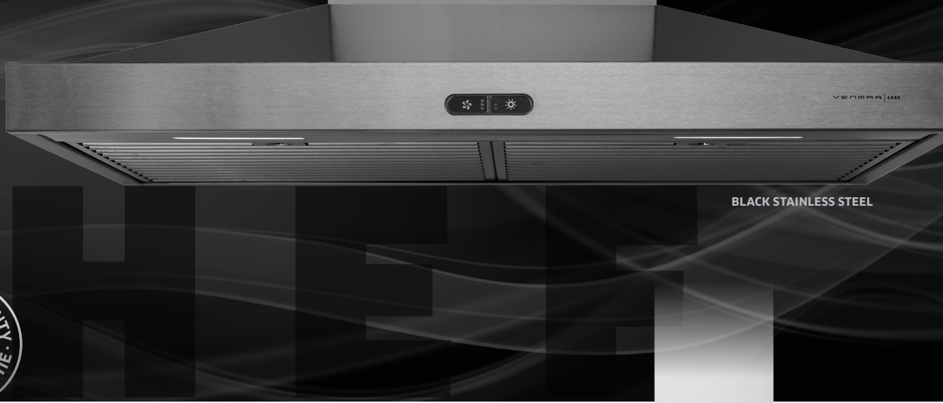
BLACK STAINLESS STEEL