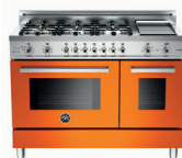
ORANGE (AR) PRO48 6G DFS AR