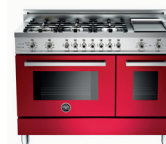
BURGUNDY (VI) PRO48 6G DFS VI