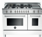
WHITE (BI) PRO48 6G DFS BI