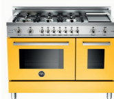
YELLOW (GI) PRO48 6G DFS GI