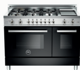
BLACK (NE) PRO48 6G DFS NE