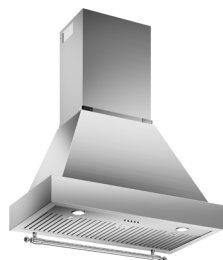
K36HERTX + KC36HERTX Stainless steel canopy