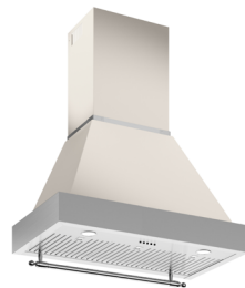
K36HERTX + KC36HERTAV Ivory gloss canopy