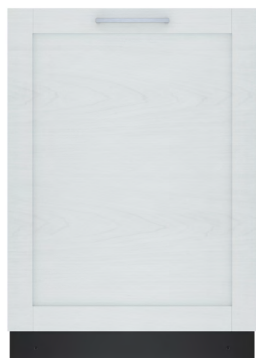
SHV53CM3N Custom Panel

The 3rd rack provides the perfect space for silverware and large utensils while its V shape leaves room below for taller items.