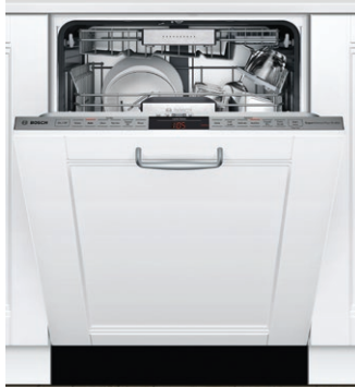
SHV88PZ53N Custom Panel

Patented CrystalDry™ technology transforms moisture into heat to get dishes, including plastics, 60% drier.+