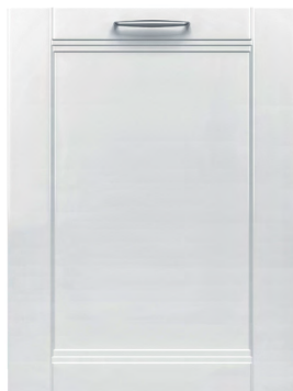
SHV9PCM3N Custom Panel

PowerControl™ spray arm targets your dirtiest dishes with a deeper clean, no matter where you load them on the bottom rack.