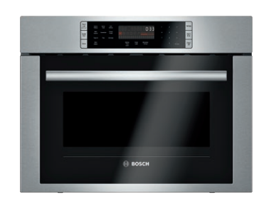
HMC54151UC Stainless Steel

The 24" speed oven pairs the cooking qualities of a conventional oven with the speed of a microwave, designed for smaller spaces.