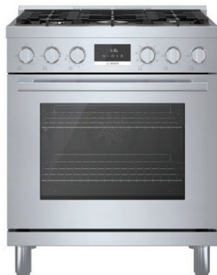
HDS8055C Stainless Steel