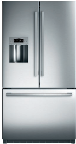
B26FT50SNS Stainless Steel

The standard-depth French Door refrigerator offers large storage capacity and optimal freshness to keep your food fresher longer.