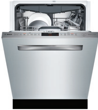
SHP68T55UC Stainless Steel

The new 3rd rack now offers 30% more loading area. Perfect for ramekins, cooking utensils and extra-long silverware.