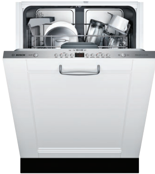
SHV53TL3UC Panel Ready

Bosch dishwashers are so quiet, you may forget they're on. InfoLight® projects a red light onto the floor to let you know it's on.