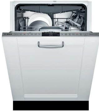
SHV68TL3UC Panel Ready

The 3rd rack offers 30% more loading area. Perfect for ramekins, cooking utensils and extra-long silverware.