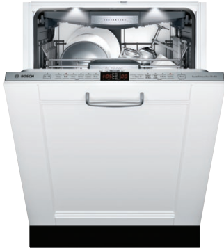
SHV9PT53UC Panel Ready

Expandable wings on our flexible 3rd rack provide extra height to fit ramekins, measuring cups and extra-large utensils.