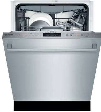
SHX68TL5UC Stainless Steel

The new 3rd rack now offers 30% more loading area. Perfect for ramekins, cooking utensils and extra-long silverware.