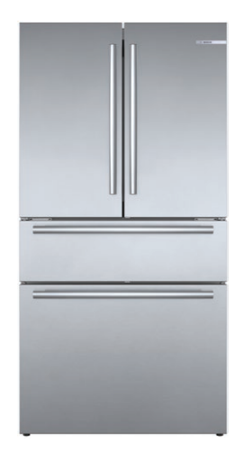
B36CL80SNS Stainless Steel

Introducing the revolutionary, new FarmFresh System™, with four freshness technologies designed to work together to keep your food fresher, longer. Enjoy less food waste, new innovative features and more thoughtful design.