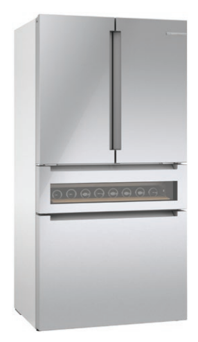
B36CL81ENG Glass over Stainless Steel w/ Recessed Handles

The industry's first Refreshment Center featuring the new glass front display drawer. Presenting a dedicated drawer with five preprogrammed settings, providing the optimal storage environment for all of your beverage needs.