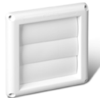
V142 Exterior Wall Cap