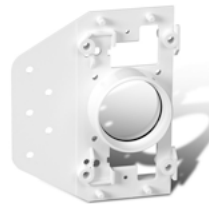
V144 Plastic Mounting Plate