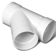
V123 45° "Y" 2 in. (51 mm) dia.