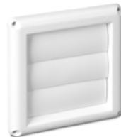
V142 Exterior Wall Cap