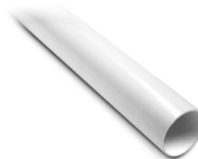
V131 PVC Tubing 2 in. (51 mm) dia. 10 ft. (3.0 m) length