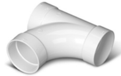
V124 90° Tee 2 in. (51 mm) dia.