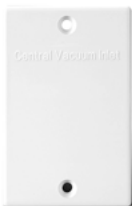
V138 Cover Plate with Screws