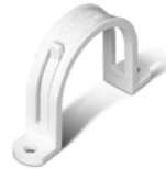
V140 Tubing Strap 2 in. (51 mm) dia.