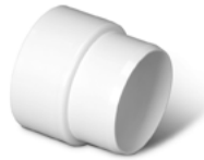
V139 Inlet Valve Extension