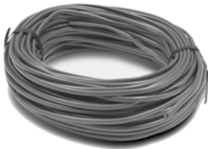
V133 Low Voltage Wire 100 ft. (30.5 m)