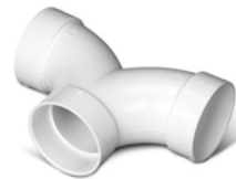
V125 90° "Y" 2 in. (51 mm) dia.