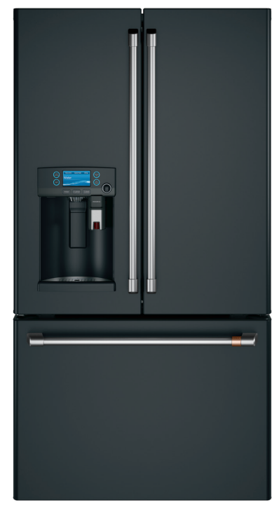
Matte Black with Brushed Stainless