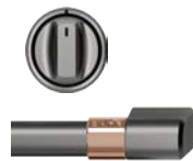
CXFCHHKPMBT Brushed Black 2 handles; 6 knobs