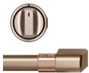
CXFCHHKPMBZ Brushed Bronze 2 handles; 6 knobs