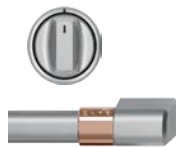
CXFCHHKPMSS Brushed Stainless 2 handles; 6 knobs