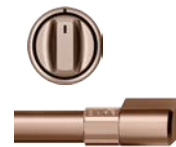
CXFCHHKPMCU Brushed Copper 2 handles; 6 knobs