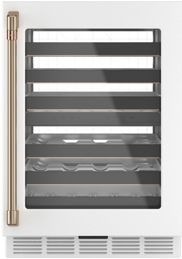
CCP06DP4PW2 Matte White with Brushed Bronze handles