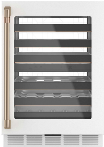
CCP06DP4PW2 Matte White with Brushed Bronze handles