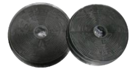
Recirculating Filters PJ2655 For CP120 Recirculating Kit