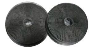
Recirculating Filters PJ2655 For CP120 Recirculating Kit