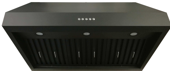
36" Matte Black