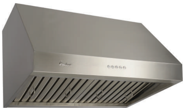
30" Stainless Steel