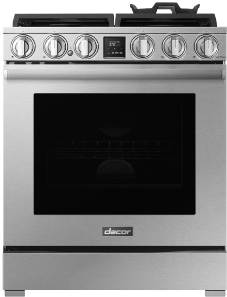
DOP30T840GS/DA - Silver Stainless, Natural Gas/Liquid Propane