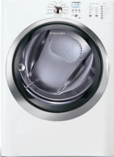
Island White EIGD55H IW