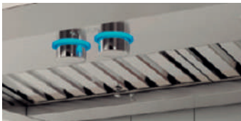
backlit hidden metallic in/out knobs

Give a splash of Italian design to your professional kitchen with Leone's crisp lines, seamless welded corner craftsmanship, beveled rim and gleaming stainless steel.