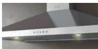
backlit electronic push button controls

Volterra, with its pyramid shaped angles and stainless steel finish, makes a striking visual statement to any kitchen. Available in 24", 30" or 36" widths, Volterra features backlit push button controls, LED lighting and 3-speed blower. It also features a telescopic chimney for up to 9'2" ceilings.