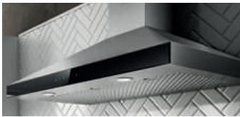
LED light with dimmer

The clean lines, beautiful sloping angles and stainless steel finish of Varna make a striking visual statement. Available in 30" or 36" width, Varna features include a powerful 600 CFM blower, LED dimmable lighting, dishwasher-safe stainless steel microhole filter, and easy to use glass capacitive touch controls that deliver convenience and safety.