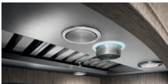
hidden metallic in/out knob controls