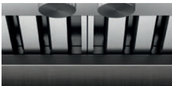
professional stainless steel baffle filters

Arezzo provides professional grade performance, while being discreetly mounted inside the cabinetry.