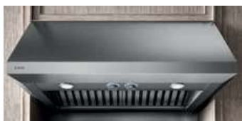
backlit hidden metallic in/out knobs