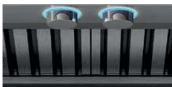
stainless steel professional baffle filters

For homeowners who are passionate about the culinary arts, the seamless welded corner craftsmanship, traditional styling and gleaming stainless steel of Calabria, provides the look and performance you expect from a professional-grade range hood. With the new backlit hidden knob controls and traditional baffle filters, Calabria is available in 30", 36", 42", and 48" widths and equipped with a 600 CFM (30") or 1200 CFM blower (36", 42", 48") to support all cooking needs.