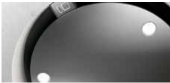
LED ambient light