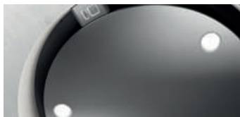
LED ambient light